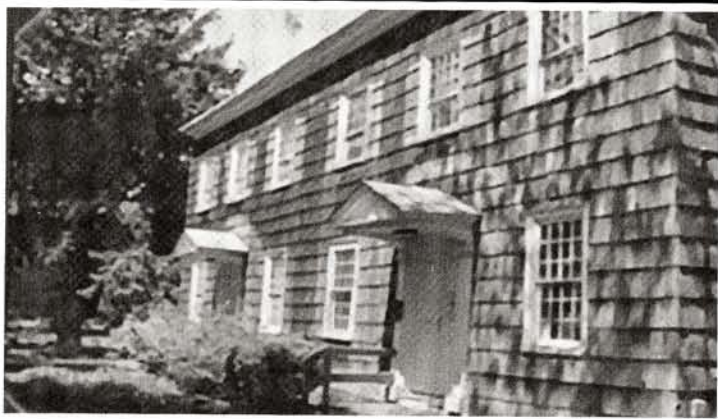
Friends Meeting House, Shrewsbury, New Jersey, 1816.

This narrative has sometimes been questioned and sometimes been taken to prove that Fox was an instrument in working miracles. Neither solution is satisfactory, or necessary. Recent medical annals give similar cases. A dislocated neck is not necessarily fatal. The incident shows again Fox's readiness in dealing coolly and skillfully with hard situations. He endeavors to do what can be done (2).